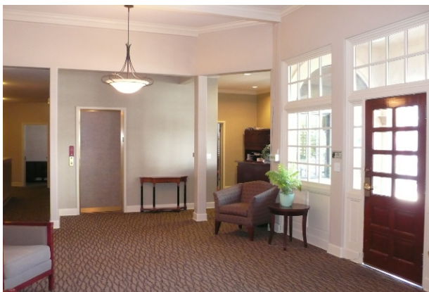
De Young Memorial Chapel Interior Lobby

Dated, inefficient light fixtures were replaced with more efficient wrought iron light fixtures to bring the building up to today's energy standards. Tired and dark carpets, wall coverings, and ceiling finishes were replaced in the Lobby, Reception Area, Family Arrangement Office, Visitation Rooms, and Drawing Room with a