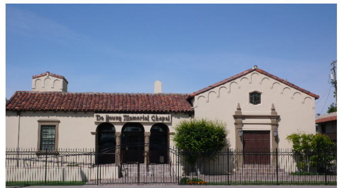
De Young Memorial Chapel Façade—Street View